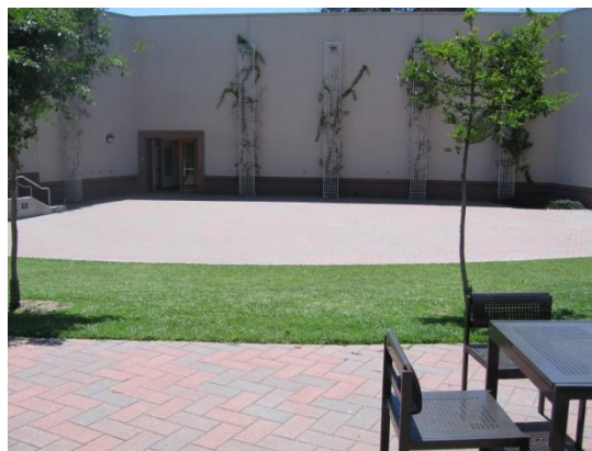
(HSSB Courtyard's Amphitheater)